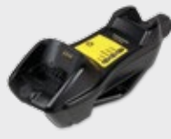
• BC9130-BT Base/Dual Charger, Multi-Interface • BC9180-BT Base/Dual Charger, Multi-Interface/Ethernet (Standard, Industrial)