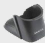
• HLD-P080 Desk/Wall Holder (HLD-8000)