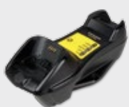
• BC9030-BT Base/Charger, Multi-Interface